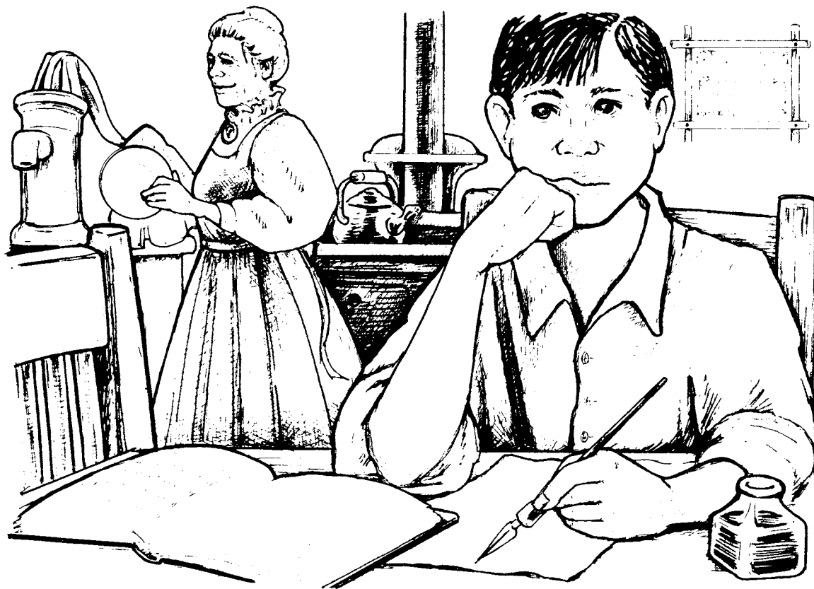
Huck tries to be a good boy for the Widow.